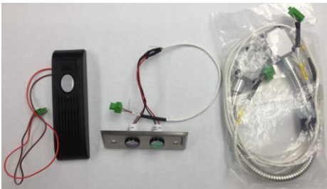
Electronic Kit Components

“We wish to express our appreciation to all our customers for the opportunity to serve”